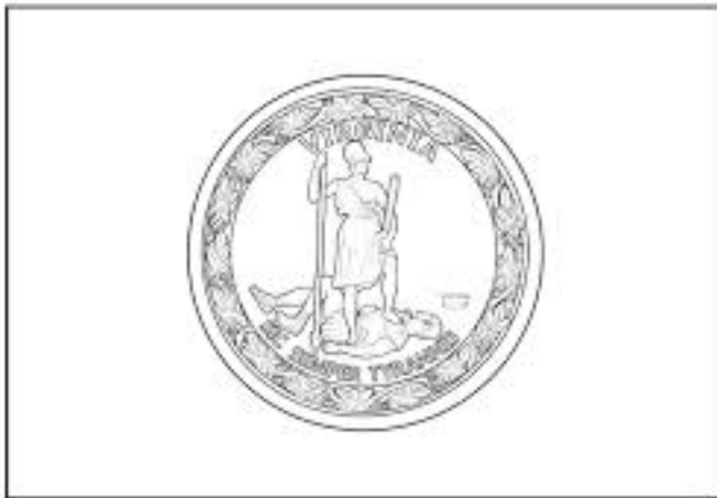
VIRGINIA STATE FLAG

The Virginia Flag is a patriotic symbol!